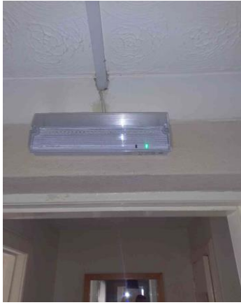
EML Self Test - Hall (Floor 1)